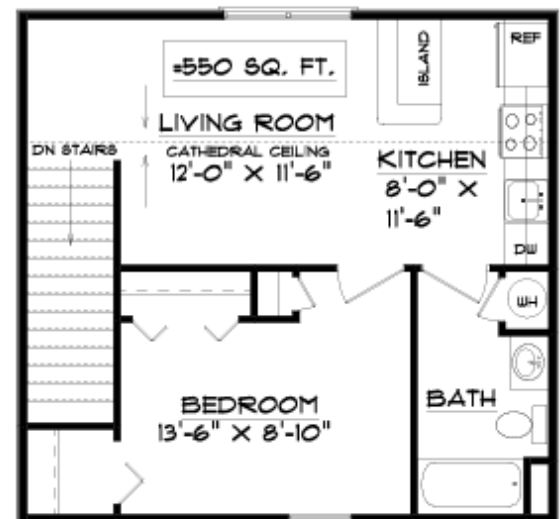
2ND FLOOR UNIT